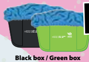
Black box / Green box