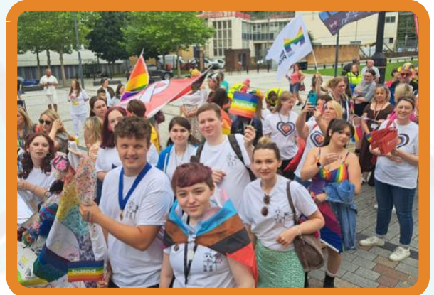
The YAP joined with MTBWYF to celebrate Merthyr Pride 2024.

Together Snakes 'N' Ladders and MTBWYF spread the word about both projects goals and invited any 11-25 year olds to join them.