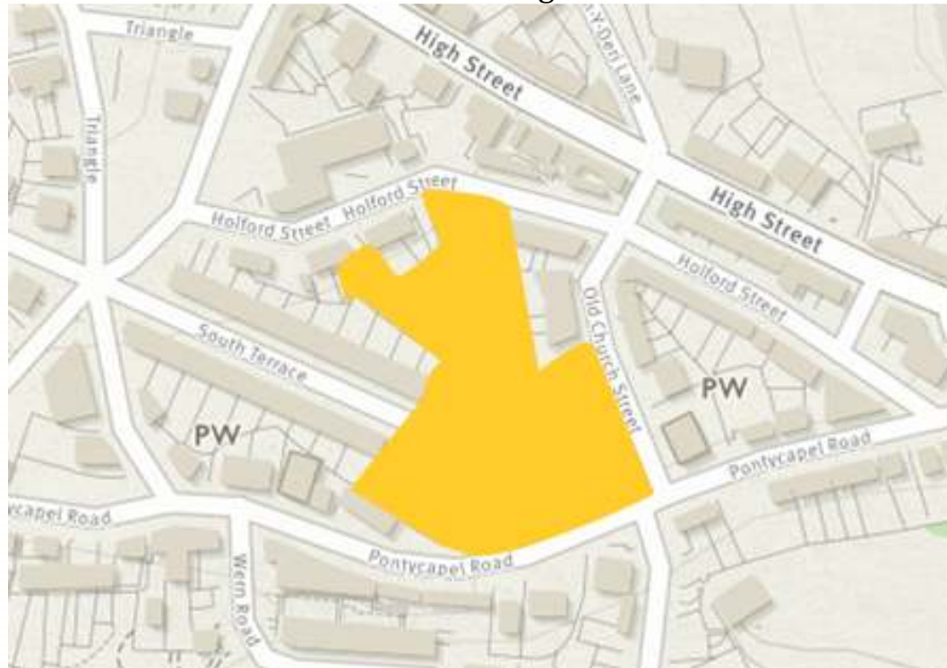
Image 2 – The former Vaynor and Penderyn High School Site location

Please see the site location in the image below.