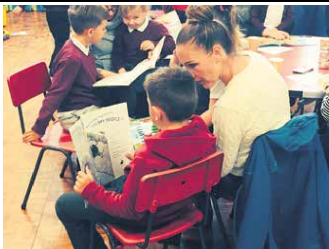
Trelewis Primary School