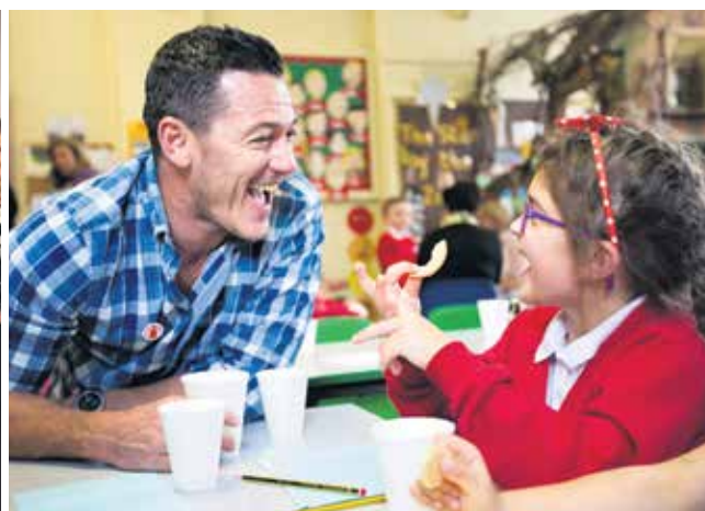
Luke Evans School Visit

Schools across Merthyr Tydfil value involving parents and carers in supporting their children in school. Families are invited to join in with school life, both formally and informally. This has a big impact on both learning and wellbeing.