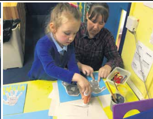
St Mary's RC Primary School