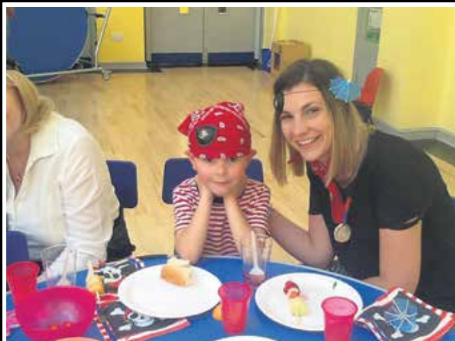
Abercanaid Community School