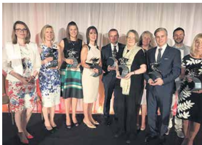
Teaching Awards Cymru