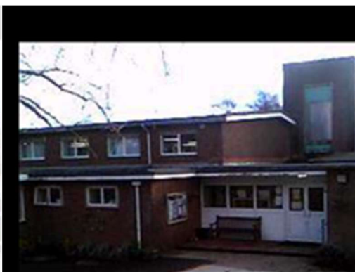
GOETRE PRIMARY SCHOOL