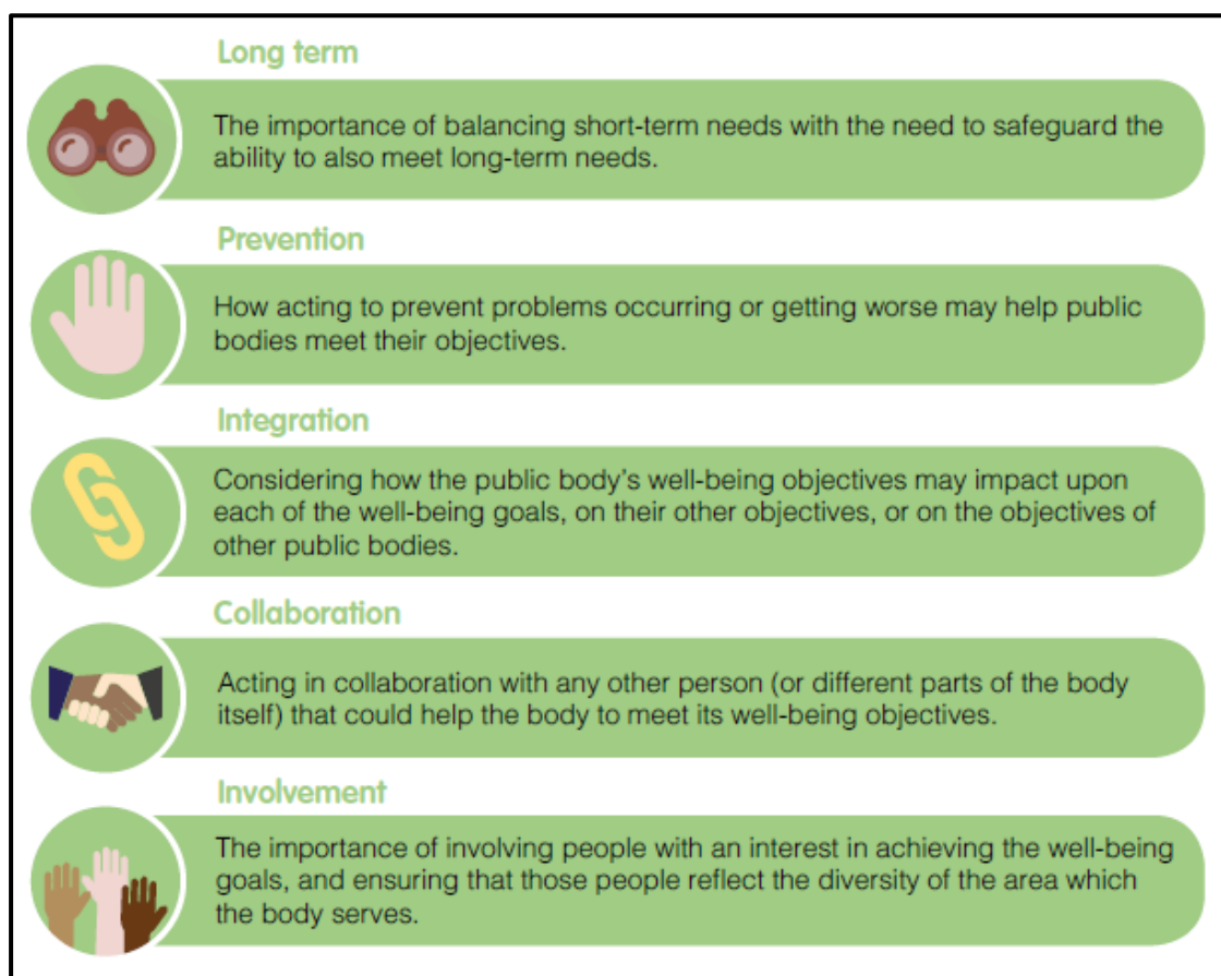
Figure 5.4: Definition of the Well-being of Future Generation's Five Ways of working

5.8 The five ways of working have been adopted as 'key principles' in Planning Policy Wales (PPW) (Edition 10). Table 5.2 below demonstrates how the objectives and policies contained within the Deposit LDP (as amended) are compatible with and positively contribute towards the Five Ways of Working.