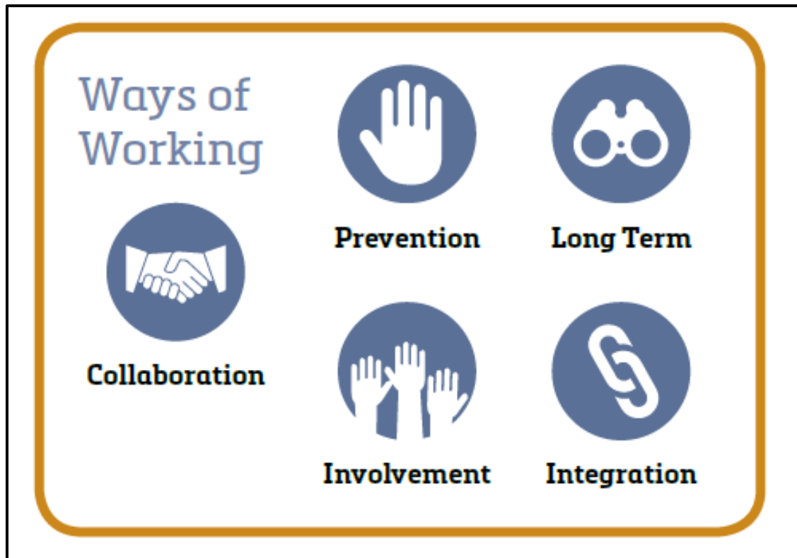
Figure 5.3: The Well-being of Future Generation's Five Ways of Working