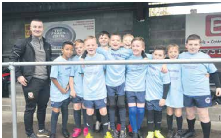
WINNERS! Pupils from Dowlais Primary School, representing Namibia