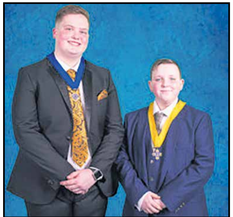
This year's Youth Mayor and Deputy Youth Mayor

To find out more about how you or your community can benefit from the scheme, ring 01685 725467 or visit Ruralaction@merthyr.gov.uk .