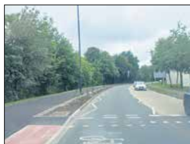
Avenue De Clichy